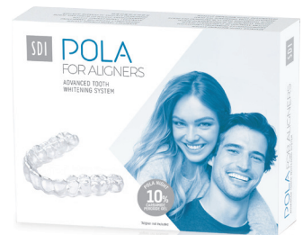
POLA FOR ALIGNERS - 7700556 10% CP 4X3G SYRINGES