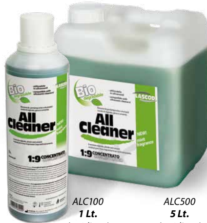
ALC100 1 Lt. (=10 litres)