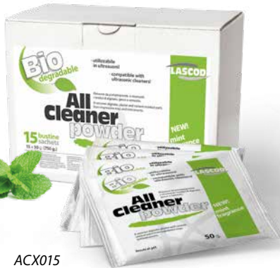
ACX015 15 x 50g. (=15 litres)

You can find All Cleaner in Powder version (15x50g sachets enough for 15 litres of solution) or concentrated liquid: 1 package of 1 liter to get 10 litres of solution, or 5 litres package to get 50 litres of solution.